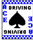
Driving Ace Card