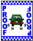
Puncher Proof Card