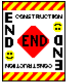
End of Construction